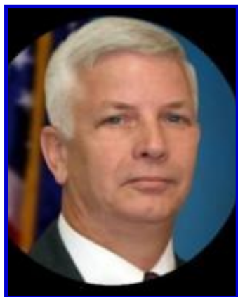
2024-2025 District Governor