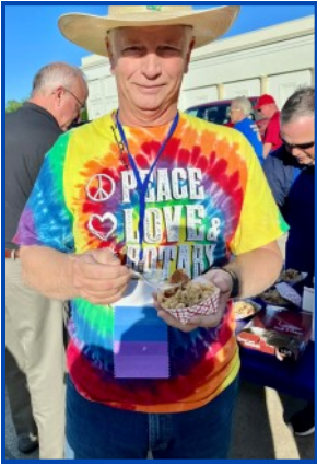
2024-2025 District Governor